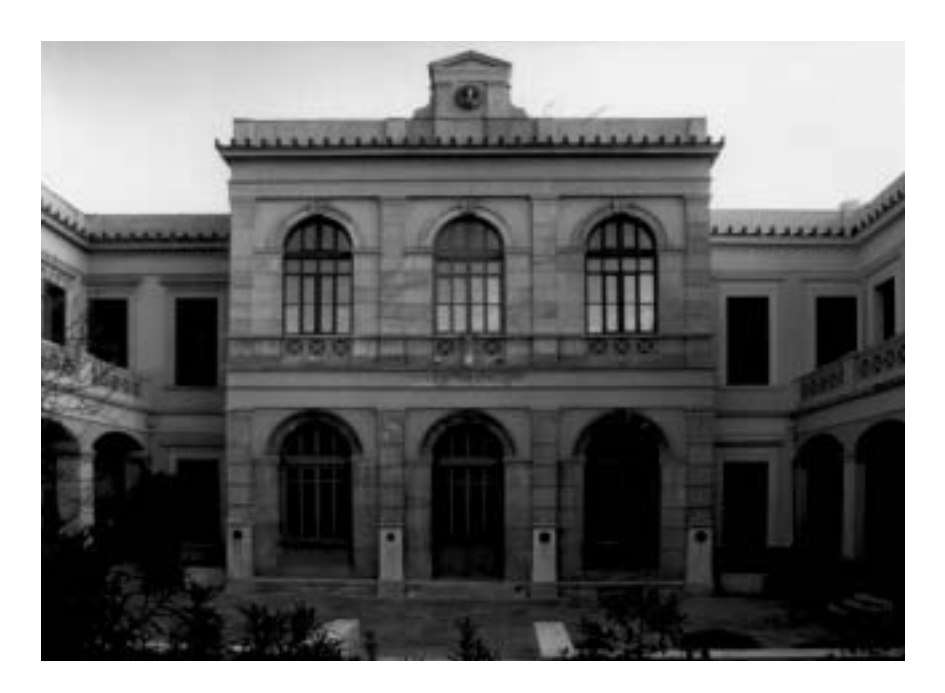
The French School (EFA)

In addition to the Director, it has an academic and administrative staff of about 45 members as well as twelve Membres scientifiques (fellows). Although it is mainly government funded, it is also supported by private donors.