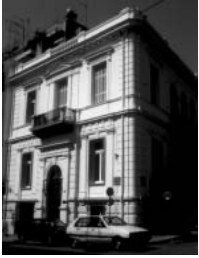
The Swedish Institute (SIA)

In Athens itself, the Swedish Institute is based in a fine Neo-Classical building in the district of Makriyianni, immediately to the south of the Acropolis. In the past, the building housed the Office as well as the Hostel and Library of the Institute. Recently, however, following extensive renovations, its library was amalgamated with those of the other Scandinavian Institutes and moved into a separate building bought for this purpose and named "The Nordic Library". The Nordic Library caters mainly for Scandinavian scholars but also welcomes Greek and non-Greek scholars from outside Scandinavia.