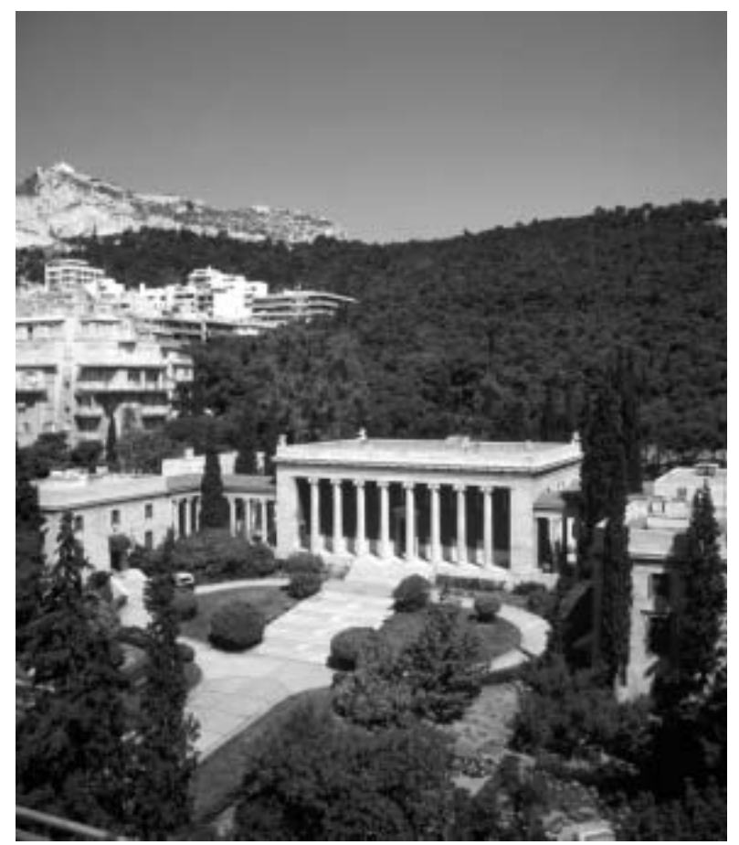
The American School (ASCSA) The Gennadeios Bibliotheke

As mentioned above, the American School depends almost entirely upon private support. It charges for membership, however, and applies occasionally for government grants for specific projects.