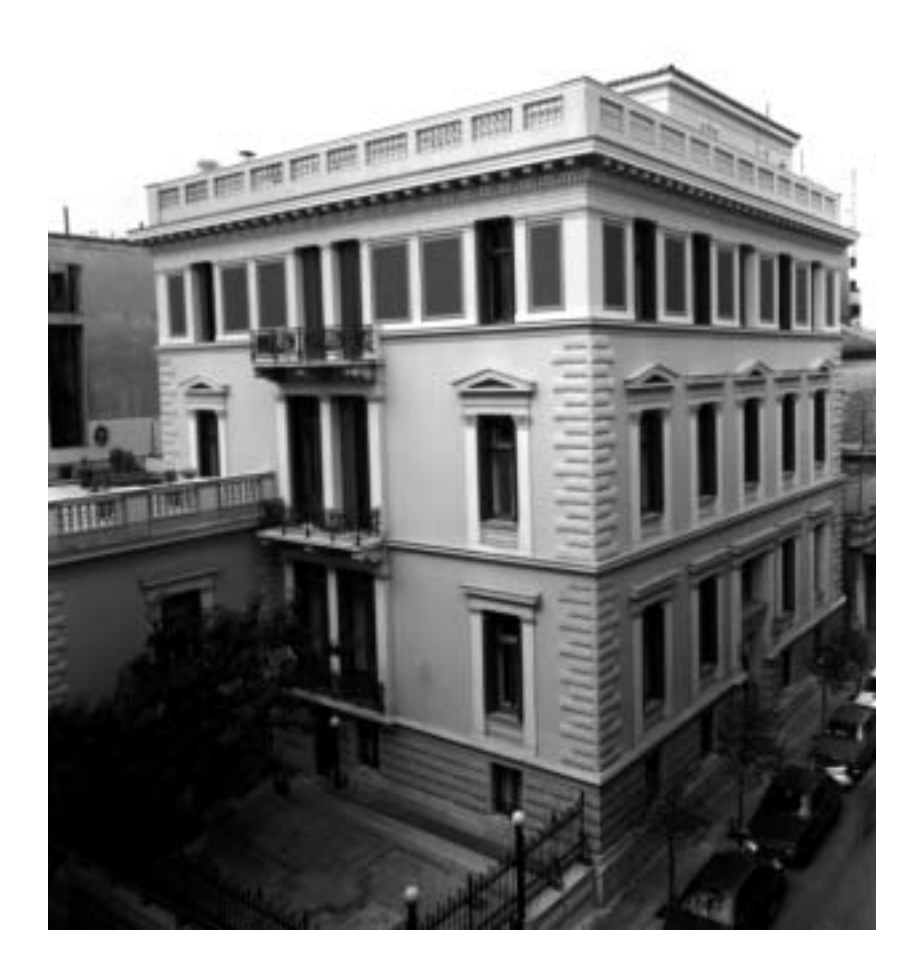
The German Archaeological Institute (DAIA)