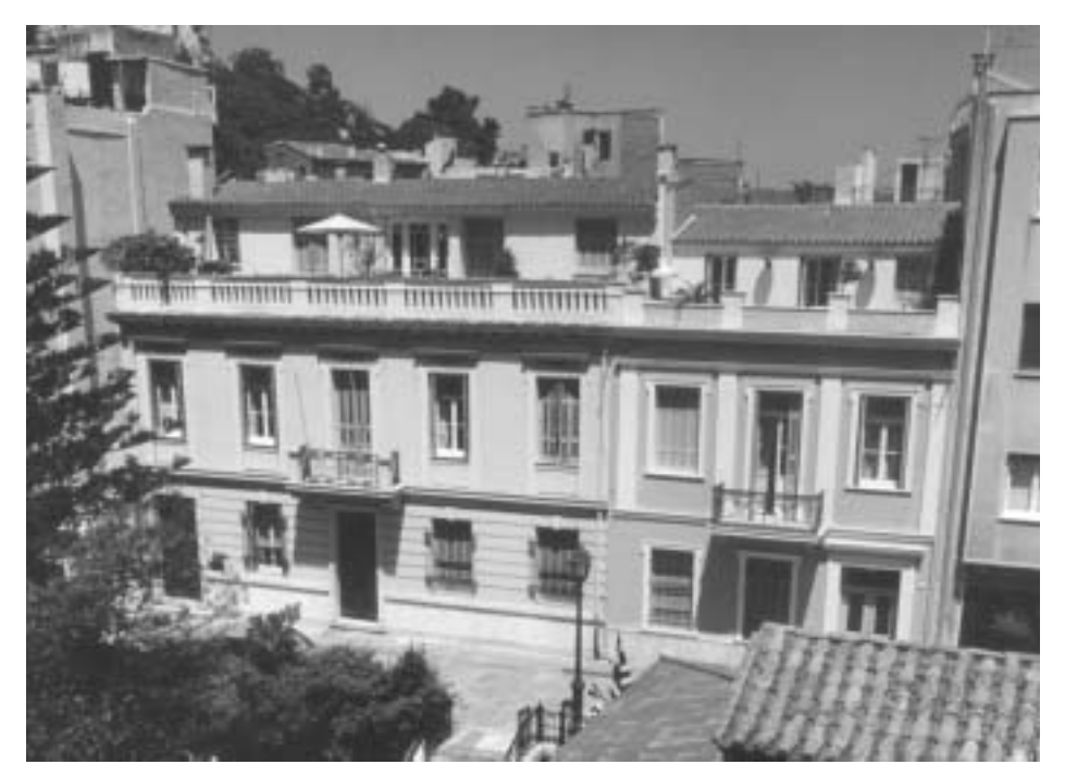
The Danish Institute (DIA)

The Danish Institute is housed in two attractive Neo-Classical buildings in the district of Plaka immediately to the North of the Acropolis, and runs an academic programme, which includes lectures, seminars, conferences and art exhibitions. It is funded mainly by the Ministry of Science, Technology and Innovation, with additional support from the Danish National Museum and the Universities of Aarhus, Copenhagen and Southern Denmark. Its staff consists of the Director, the Assistant Director, two secretaries and an Accountant.