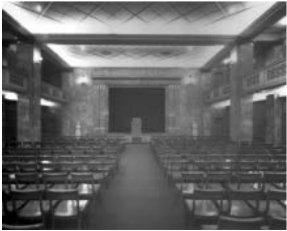
The Athens Archaeological Society (AAS) Lecture Theatre

The Athens Archaeological Society publishes four learned journals: The Praktika tes en Athenais Archaiologikes Etaireias [ Praktika ] (since 1837); Archaiologike Ephemeris: Periodikon tes en Athenais Archaiologikes Etaireias [ Archaiologike Ephemeris ] (since 1837); To ergon tes Archaiologikes Etaireias [ Ergon ] (since 1954) and O Mentor: Chronographiko kai istoriodiphiko deltio tes en Athenais Archaiologikes