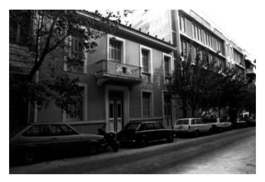
The Italian School (SAIA) On the left the Director's Residence

The Italian School publishes on an annual basis the journal Annuario della Scuola Archeologica Italiana di Atene e delle Missioni in Oriente (since 1914). Other publications appear in the series Monografie della Scuola Archeologica di Atene e delle Missioni Italiane in Oriente . Studies on Gortyna, Haghia Triada and Hephaistia are published in this series.