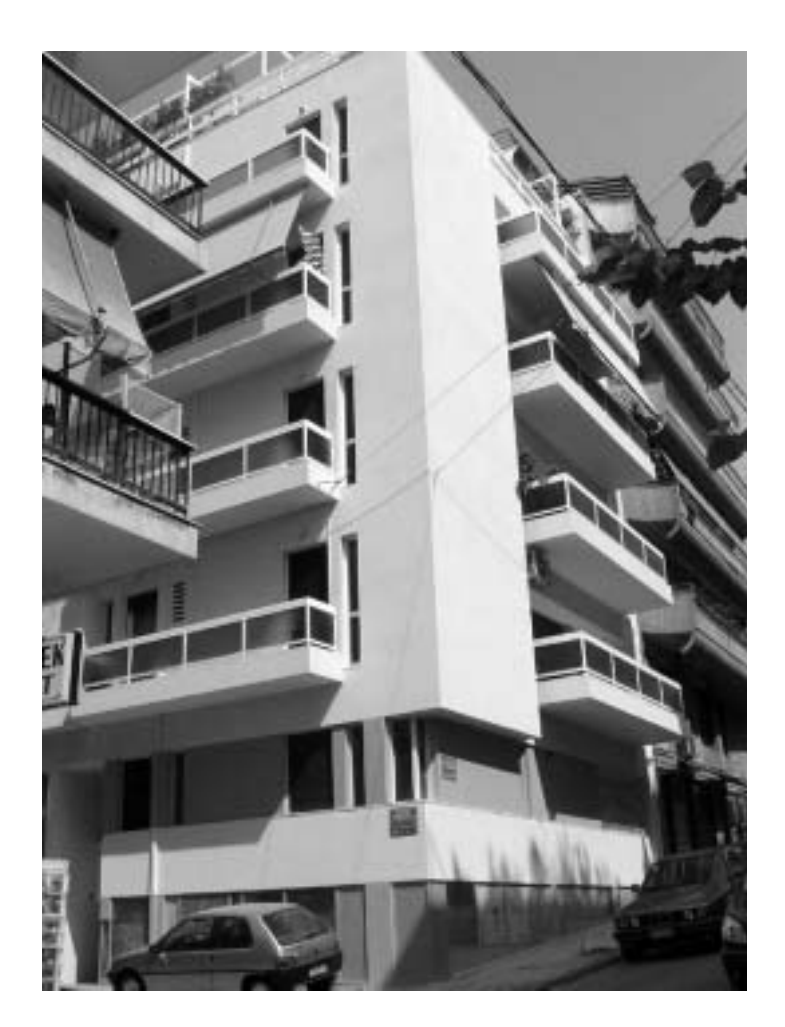
The Hostel of the Australian Archaeological Institute (AAIA) -(The flat with the uppermost balconies)