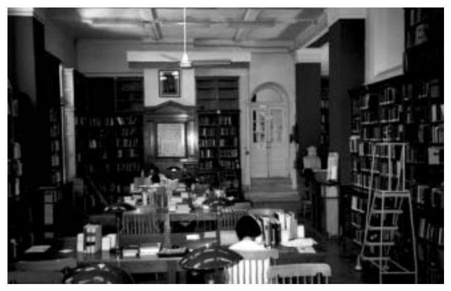
The Library of the British School (BSA)

on an annual basis the Archaeological Reports which contains summaries of the results of field-work and other archaeological activities in Greece carried out not only by itself but also by the Greek Archaeological Service and the other Foreign Schools and Institutes. Since 1986, the BSA also publishes the Fitch Laboratory Occasional Papers of studies on archaeological science. Finally, the series BSA Studies was initiated in 1995; some of its volumes are conference proceedings on research on a particular topic.